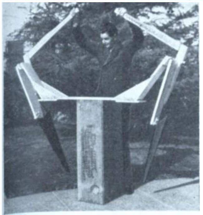
Propelling mechanism for a rowboat